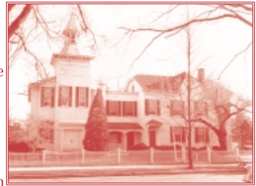
Talbot's County's First Public High School 106 South Street

At S. Washington, 59 Easton Memorial Hospital buildings begin. Turn S, passing 60 interesting homes on E side. At 400 block cross to W side until you come to Quaker Meeting Lane with historical marker. Turn W to reach the wonderful 61 Third Haven Meeting House, completed in 1684 and reputed to be Maryland's oldest frame building – open daily to public. See the interior construction and design – enjoy the tranquility! Return to Washington; go N to Earle Ave., then E on Earle, and N on Harrison, enjoying 62 lovely tree-lined street with early to mid 20th c. residences. Continue crossing Brookletts and South Sts., passing 63 Armory on R and outstanding 64 Stevens/Hambleton House, c. 1794, with double-tiered porch. Continue to 1 Easton Welcome and Resource Center.