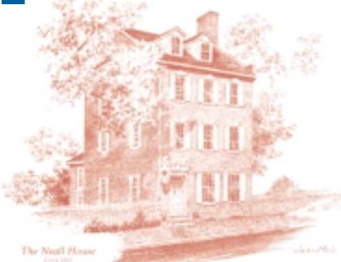
Historical Society of Talbot County 27 South Washington Street

Leaving 1 the Easton Welcome and Resource Center (11 S. Harrison St., 410-820-8822) look across Harrison to see 2 Bullitt House and gardens, c. 1800. Proceed N on Harrison. Stop at corner of Dover. NE corner, 3 Tidewater Inn, c. 1949, replacing 1890 Avon Hotel destroyed by fire 1944; NW corner, 4 Edmondson/Pollard House, c. 1798, remodeled 1890; and SW, 5 Avalon Theater – outstanding Art Deco interior, c. 1922.